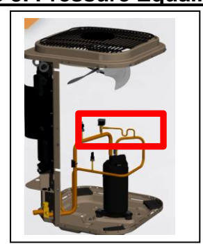
Figure 3. Pressure Equalizer Valve

The Evolution V uses a pressure equalizer valve designed to equalize pressures across the rotary compressor. The valve is energized in the off-cycle to ensure easier starting of the rotary compressor. During the equalization process, a hissing sound may be heard by customers. This sound is normal, but the customer should be made aware to avoid nuisance callbacks.