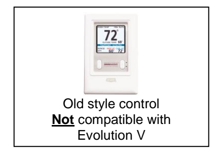
Figure 1. Old style control